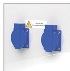
Waterproof Socket 2 waterproof sockets are located in the side panel, for optimum convenience of using small devices inside the cabinet.