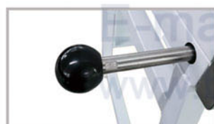
Handle Four handles on each corner, easier to move the unit to anywhere