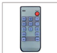
Remote Control All functions can be realized with it, making the operation much easier and convenient.