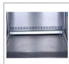
Work Zone Work zone is made of 304 stainless steel, is surrounded by negative pressure.