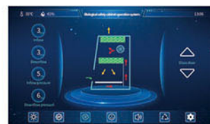
LCD Display 7 inch large touch screen is easy to monitor all the safety parameters at a glance and ergonomically sized control panel