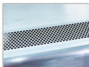
Anti-paper dust structure